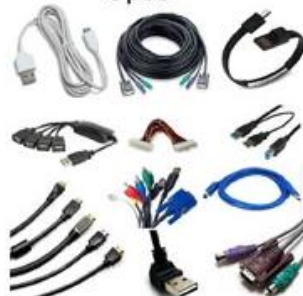
USB HDMI Cable